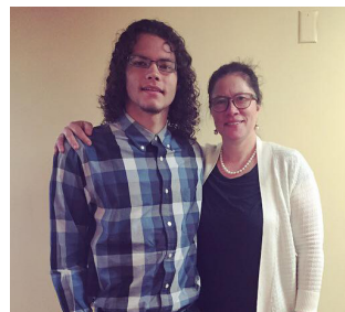
Be a mentor