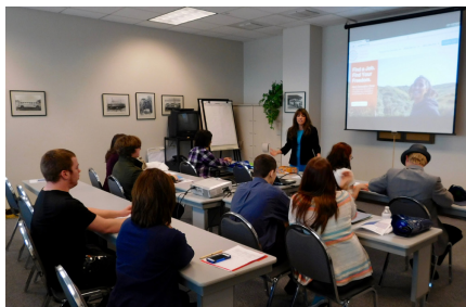
Sponsor an academy