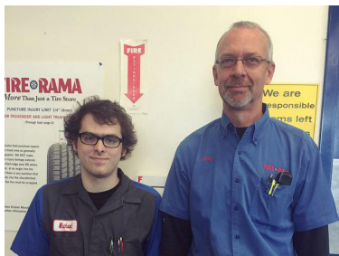
Host an industry tour