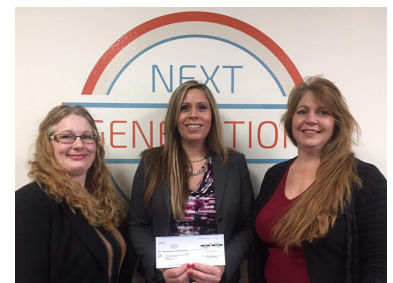
Make a donation