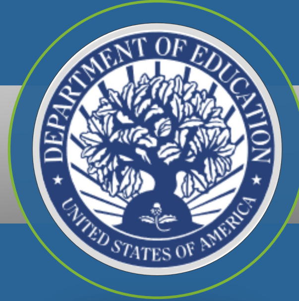
Educational Quality through Innovative Partnerships (EQUIP)