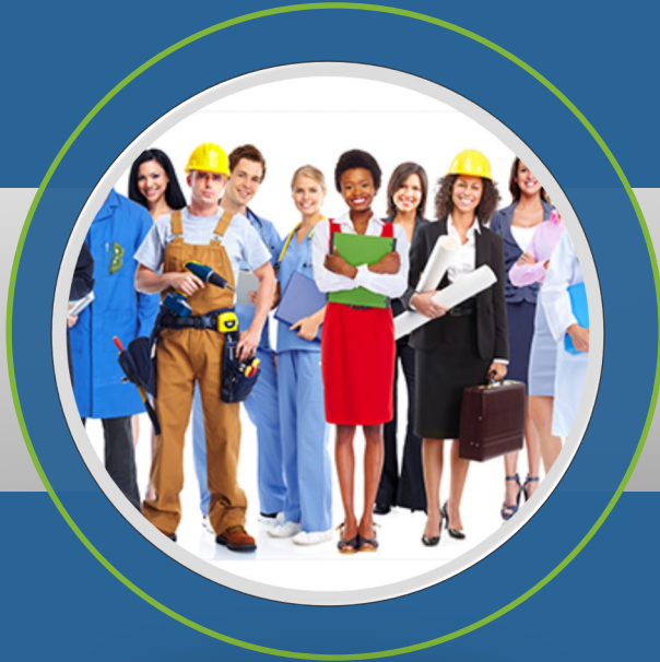
Third Multi-State Occupational Licensing Learning Consortium Meeting