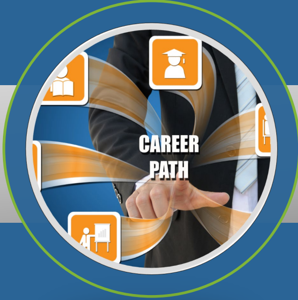
Policy Brief on Integrating SNAP E&T into Career Pathway Systems