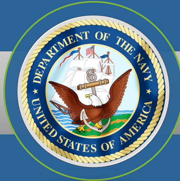
U.S. Navy and Credential Engine Partnership